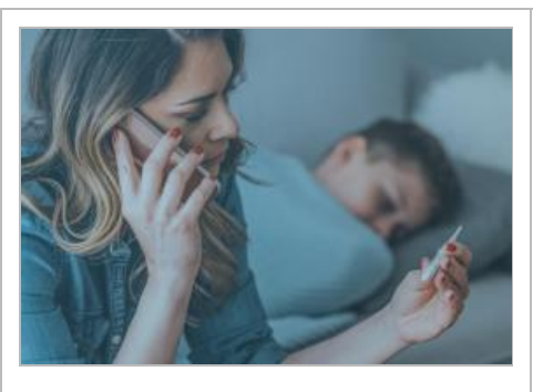
Self-Assessment + Testing

Learn about the symptoms of COVID-19, take the online self-assessment and find out how to get tested in your community.