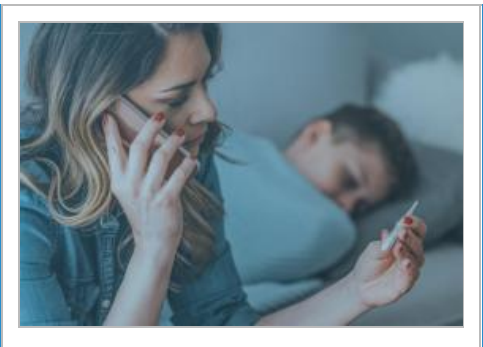
Self-Assessment + Testing

Learn about the symptoms of COVID-19, take the online self-assessment and find out how to get tested in your community.