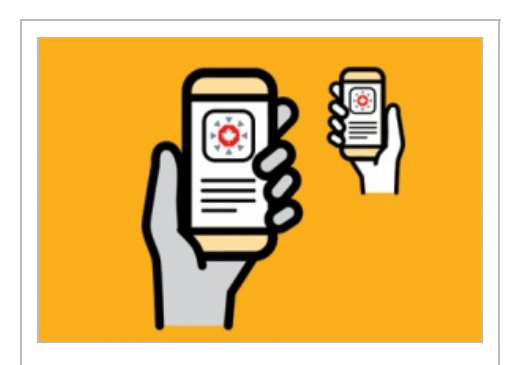
Protect your community. Download the COVID Alert app.