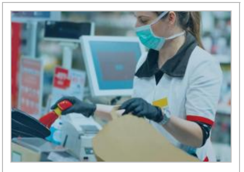
Reopening your organization