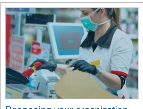
Reopening your organization