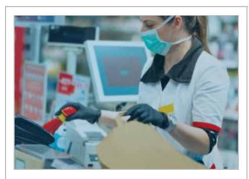
Reopening your organization