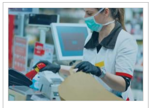
Reopening your organization