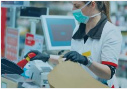
Reopening your organization