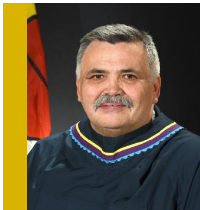
Honourable Lorne Kusugak