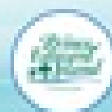
COVID-19 Self Assessment Tool