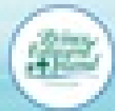
COVID-19 Self Assessment Tool