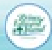
COVID-19 Self Assessment Tool