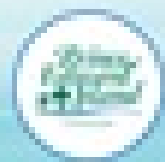
COVID-19 Self Assessment Tool