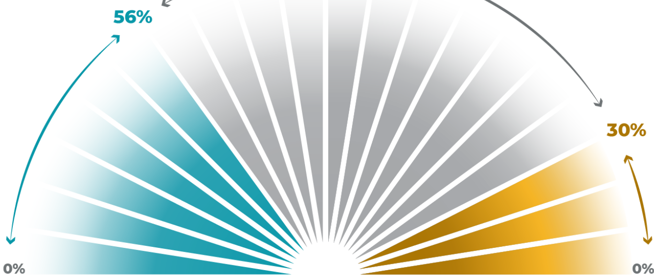
% OF ELIGIBLE YUKONERS VACCINATED