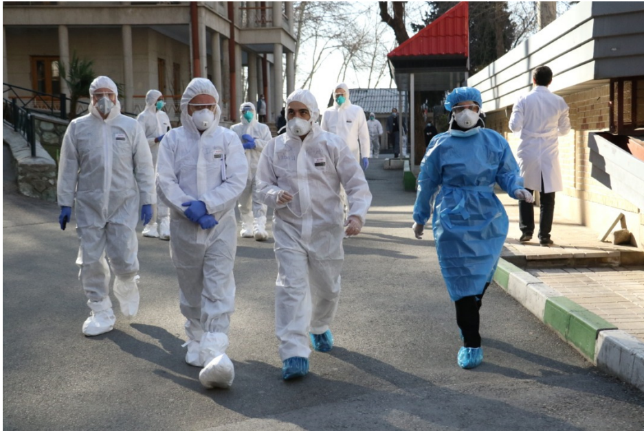
A WHO technical mission is in Islamic Republic of Iran to support the ongoing response to the coronavirus disease-2019 (COVID-19) outbreak in the country.