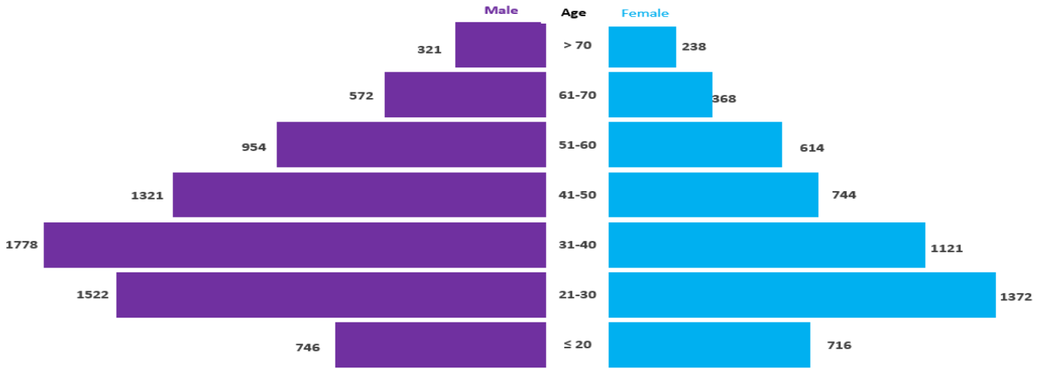
Fig 2: Age-Sex Distribution of Confirmed COVID-19 Cases, The Gambia, 2022

* This excludes the 27 confirmed cases whose demographic information are not yet available About 59% of the confirmed cases are males ( See Fig. 2 ) About 58% of the confirmed cases are 40 years below ( See Fig. 2 )