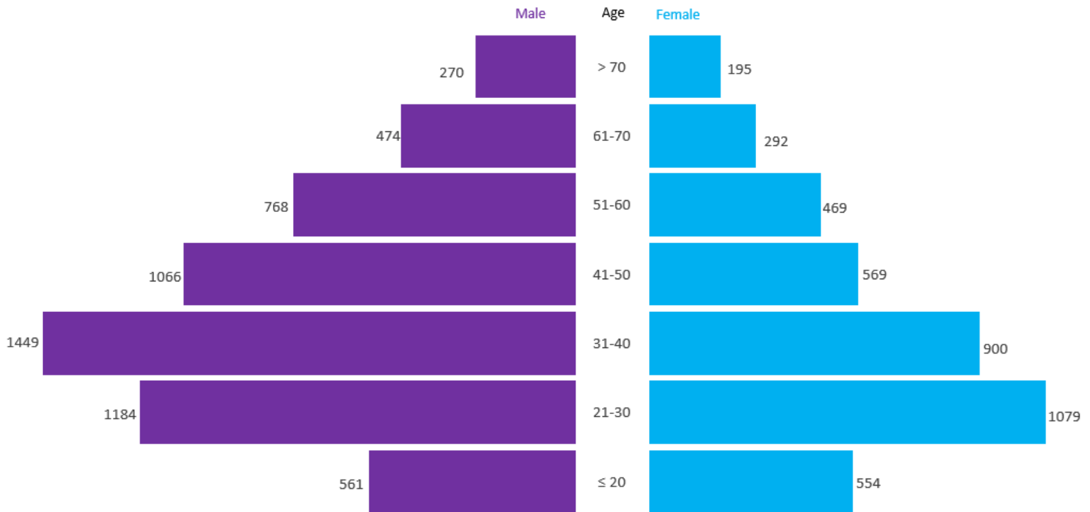
Fig 2: Age-Sex Distribution of Confirmed COVID-19 Cases, The Gambia, 2021

* This excludes the 27 confirmed cases whose demographic information are not yet available