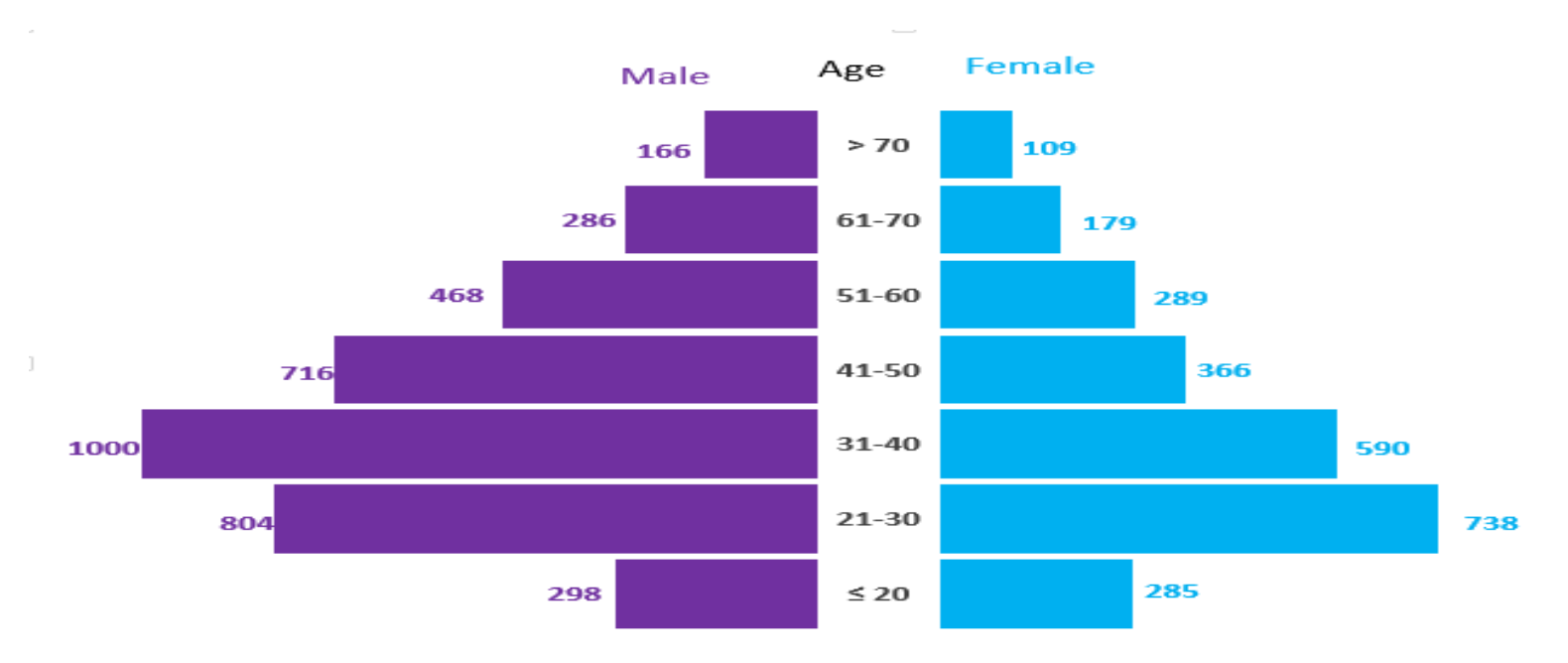
Fig 3: Age-Sex Distribution of Confirmed COVID-19 Cases, The Gambia, 2021

<sup>*</sup> This excludes the 27 confirmed cases whose demographic information are not yet available About 59% of the confirmed cases are males ( See Fig. 3 ) About 62% of the confirmed cases are below age 40 ( See Fig. 3 )