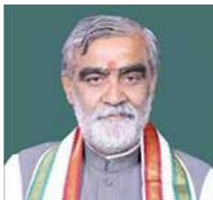
SHRI ASHWINI KUMAR CHOUBEY HON'BLE MINISTER OF STATE

Website Content Managed by Ministry of Health and Family Welfare | GOI Designed, Developed and Hosted by National Informatics Centre( NIC )