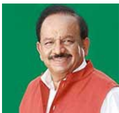
DR. HARSH VARDHAN HON'BLE CABINET MINISTER