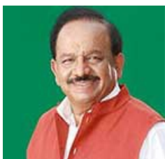
DR. HARSH VARDHAN HON'BLE CABINET MINISTER