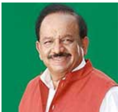
DR. HARSH VARDHAN HON'BLE CABINET MINISTER