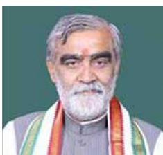
SHRI ASHWINI KUMAR CHOUBEY HON'BLE MINISTER OF STATE