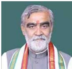
SHRI ASHWINI KUMAR CHOUBEY HON'BLE MINISTER OF STATE

Website Content Managed by Ministry of Health and Family Welfare | GOI Designed, Developed and Hosted by National Informatics Centre( NIC )