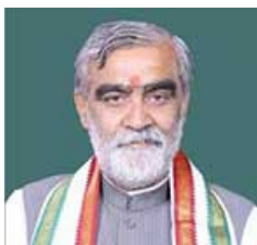
SHRI ASHWINI KUMAR CHOUBEY HON'BLE MINISTER OF STATE

Website Content Managed by Ministry of Health and Family Welfare | GOI Designed, Developed and Hosted by National Informatics Centre( NIC )