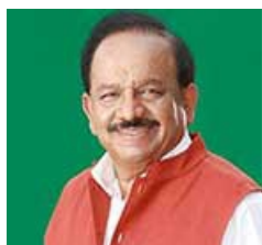
DR. HARSH VARDHAN