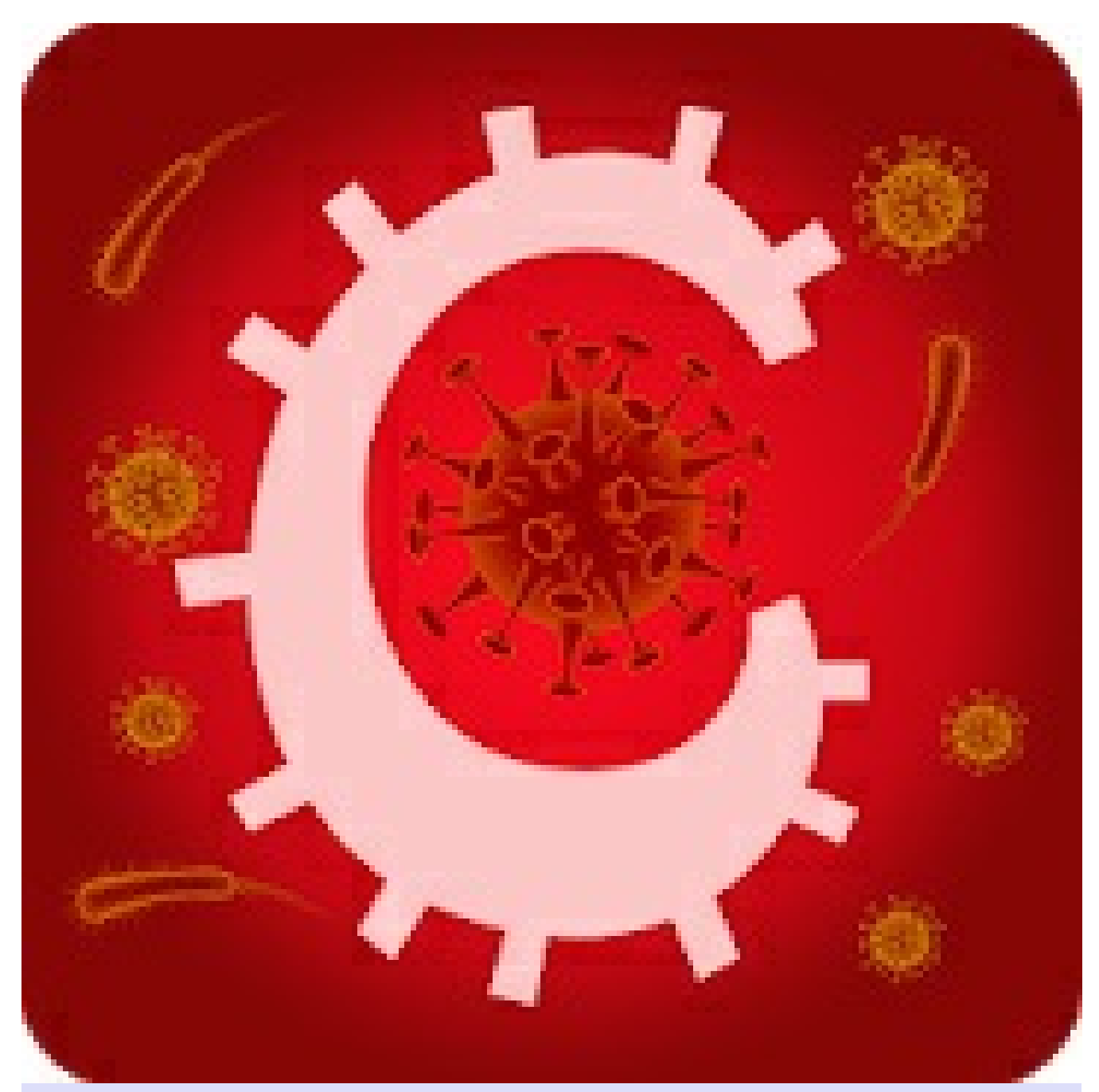
For revised guideline: Revised Guideline on use of nCOVID-19 Nagaland App