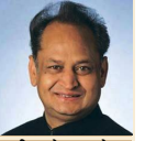
श्री अशोक गहलोत माननीय मुख्यमंत्री, राजस्थान