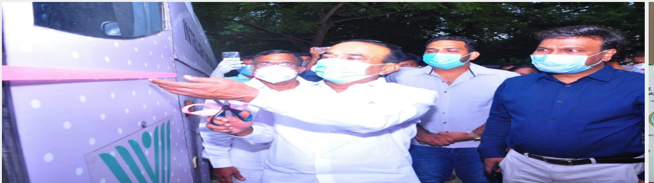
Minister launched mobile testing centres