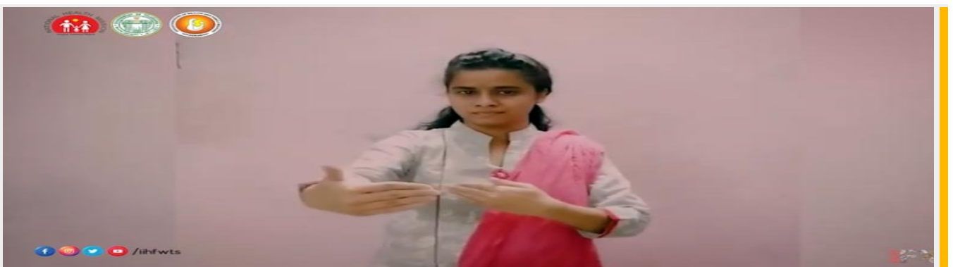
How to prevent Corona #Covid-19 by Deaf and Dem Girl