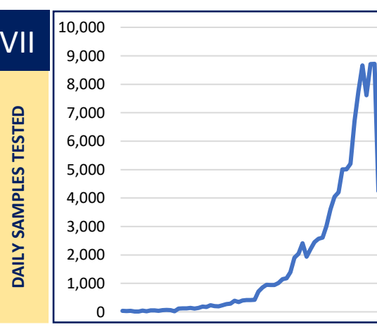
17th March to 7th June