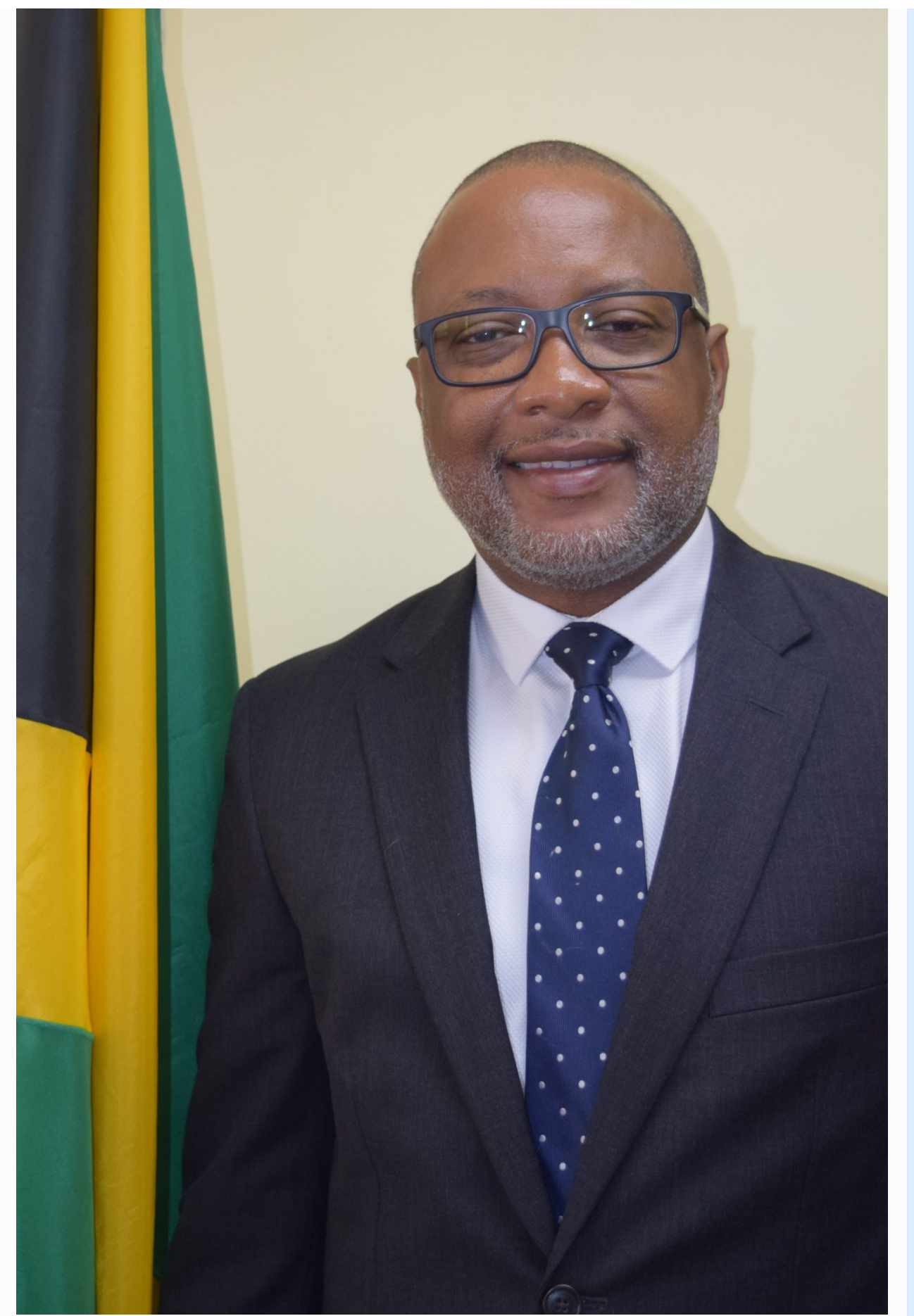
KINGSTON, Jamaica. Friday, May 1, 2020. The Ministry of Health and Wellness has so far spent $2.5 billion, of an initial $2.8 billion allocation from the Ministry of Finance and the Public Service, on efforts to contain the spread of the Coronavirus Disease 2019 (COVID-19) and to ensure the best...