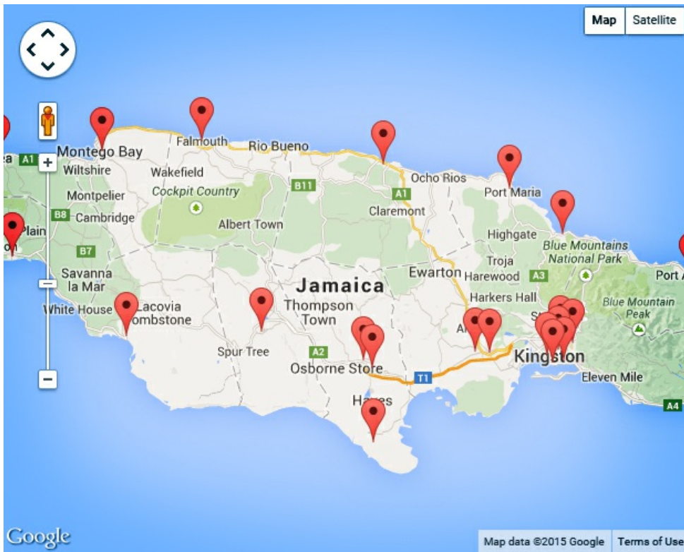
Port A View Interactive Map