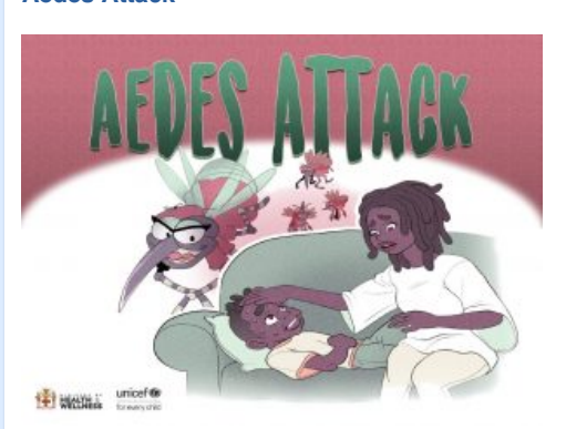
Vitals – A Quarterly Report of the Ministry of Health (May 2019)