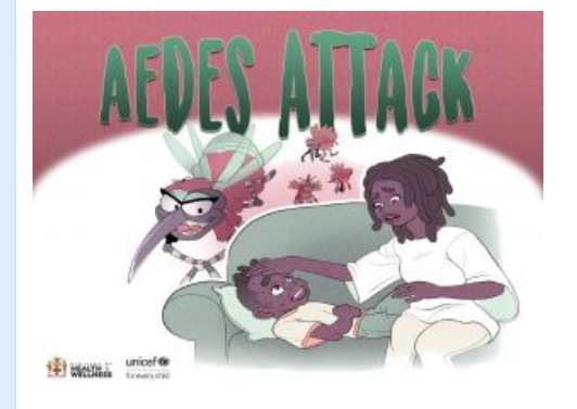
Vitals – A Quarterly Report of the Ministry of Health (May 2019)