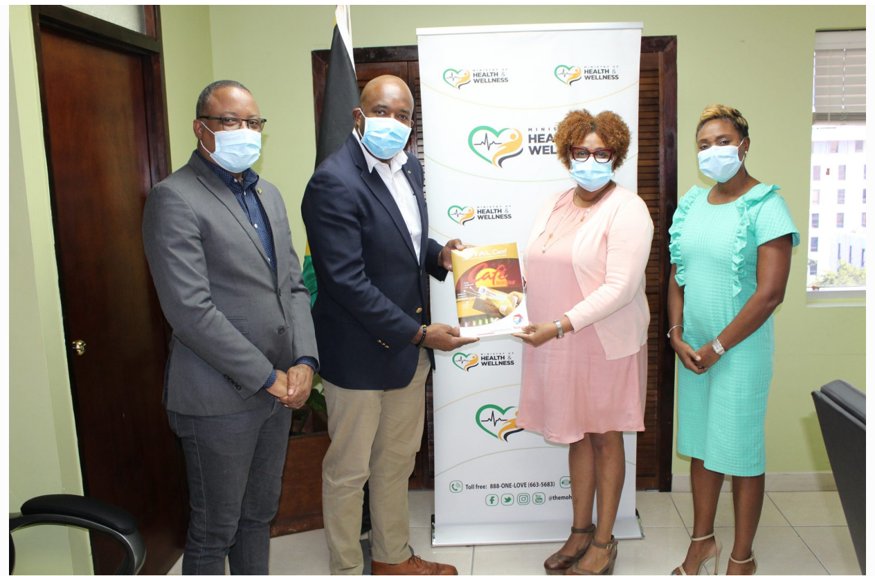
Friday, November 27, 2020: The Staff Welfare Programme of the Ministry of Health and Wellness got a boost earlier today with the award of a million dollars in gas cards for public sector workers engaged in the National COVID-19 Response efforts. The award was made by Total Jamaica during a...