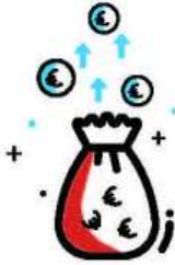
Helping to cope with cash-flow difficulties