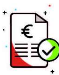
Facilitate corporate lending through state-backed guarantees