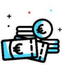
Meeting short-term liquidity needs