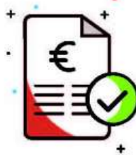
Facilitate corporate lending through state-backed guarantees