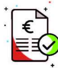
Facilitate corporate lending through state-backed guarantees