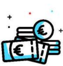
Meeting short-term liquidity needs