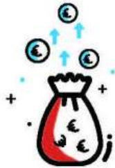
Helping to cope with cash-flow difficulties