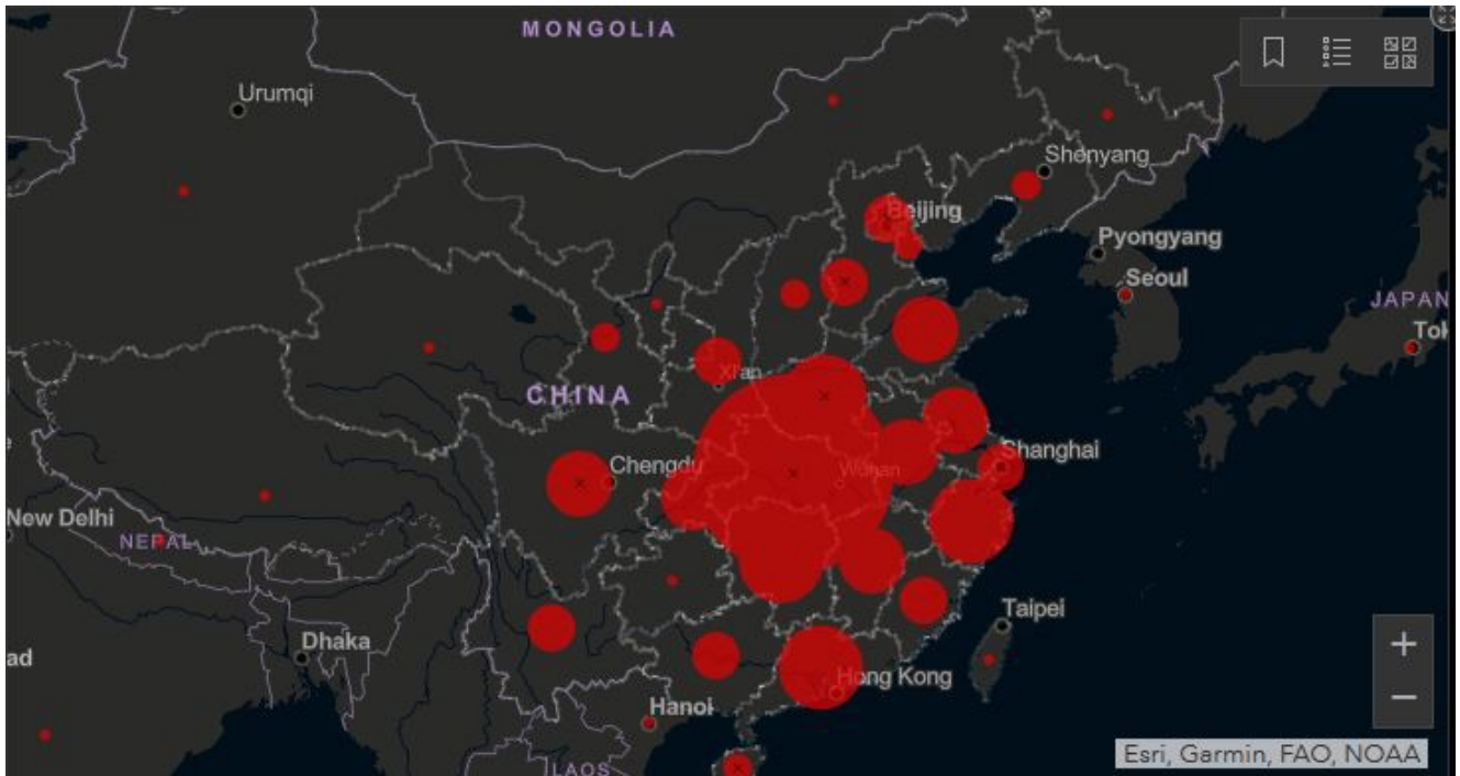
Map of Cases Worldwide (Johns Hopkins University)