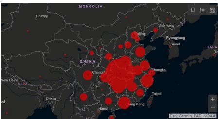
Map of Cases Worldwide (Johns Hopkins University)