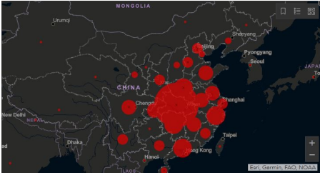
Map of Cases Worldwide (Johns Hopkins University)