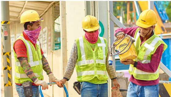
COVID-19: Advisories for Various Sectors