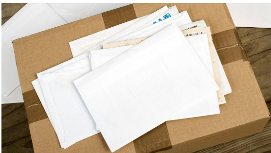
False rumour about COVID-19 virus being spread through postal articles