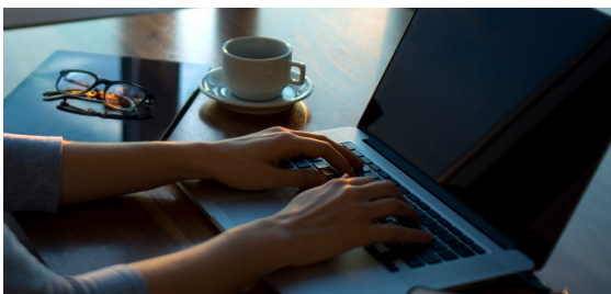
Clarifications on misinformation regarding the Coronavirus disease 2019