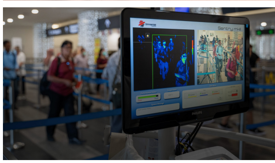
COVID-19: Travel restrictions for foreign visitors entering Singapore