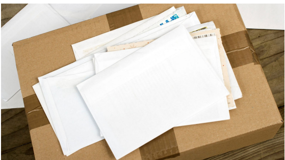
False rumour about COVID-19 virus being spread through postal articles