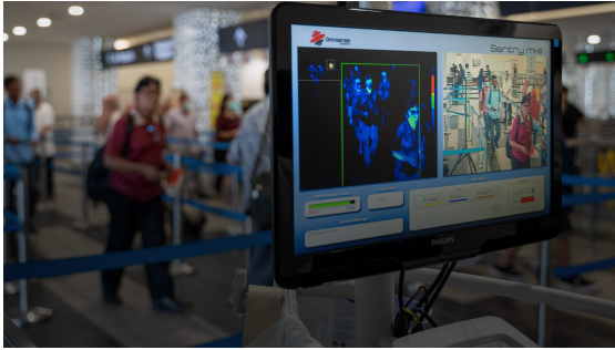
COVID-19: Travel restrictions for foreign visitors entering Singapore