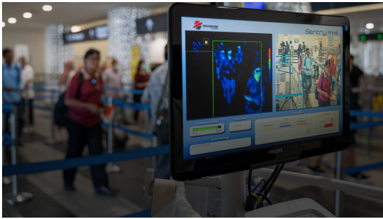
COVID-19: Travel restrictions for foreign visitors entering Singapore