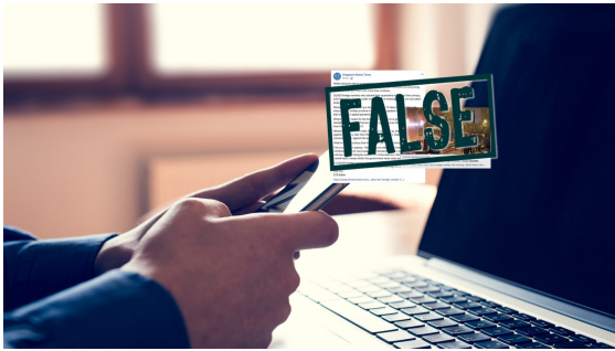
Clarification regarding falsehood published by Singapore States Times on quarantine of foreign workers