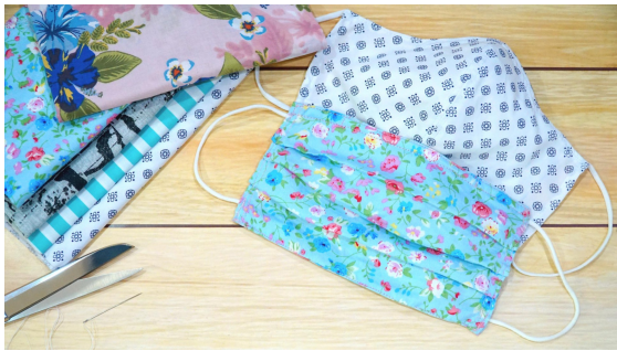
DIY your own reusable mask