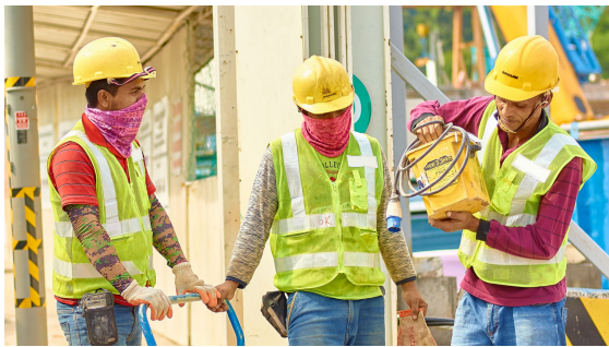
COVID-19: Advisories for Various Sectors