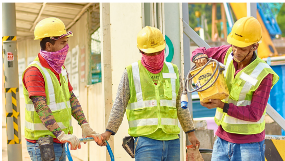
COVID-19: Advisories for Various Sectors