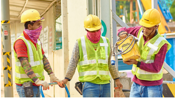
COVID-19: Advisories for Various Sectors