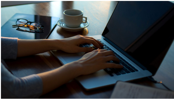
Clarifications on misinformation regarding the Coronavirus disease 2019