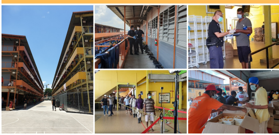
When should I wear a mask?