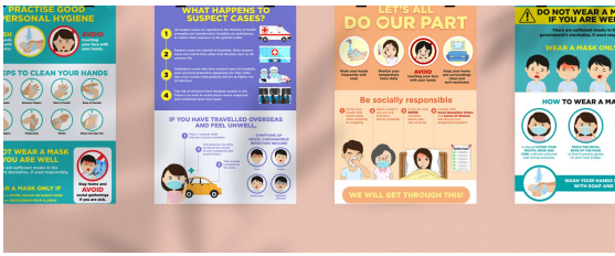
COVID-19: Advisories for Various Sectors