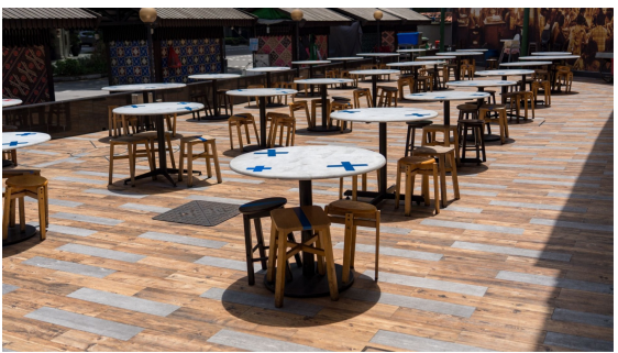
Post-circuit breaker – when can we move on to phases 2 and 3?