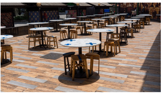
Post-circuit breaker – when can we move on to phases 2 and 3?