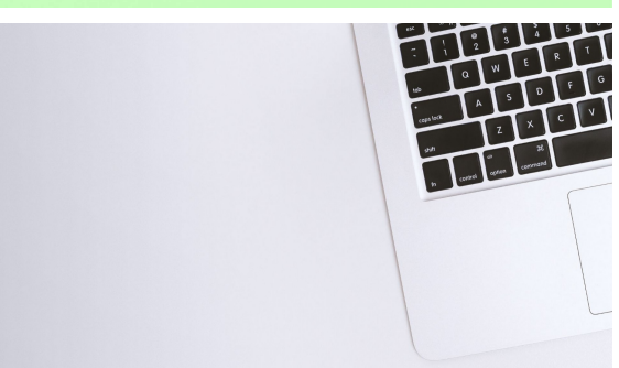
COVID-19: Updates and announcements

I am supporting my family – Staying healthy and active